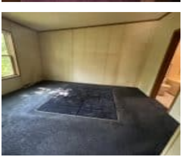
Lot 6 Lakeside estates S2 E4