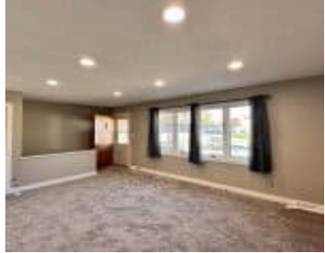
L9 & L10 N40 Blk7 South Addition Unit 4 & Garage 2 Oak Apt Condo