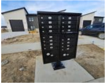
Lot A, Tract 16 River Valley Addn in N1/2SW1/4, NSC