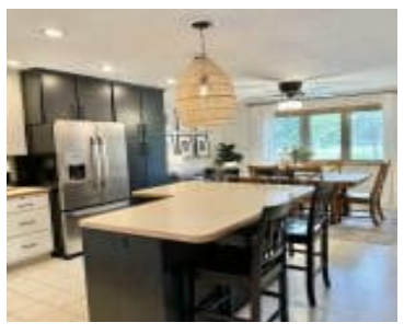
LIMOGES ADDITION LOT 9 & RR LAND ADJ TO WEST BLK 2