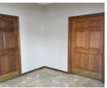
Small Law's Add Small Office Center #1 #2018 Including Undivided 50% Int in Common Area of Horizontal Property Regime Lots 1 & 2.