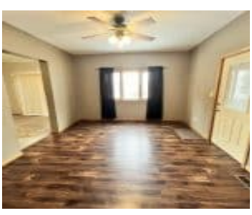
N1/2 LOT 1 BLK 15 SECOND ADDN