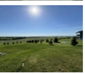
LOT 7 COPPER LEAF RES SUB 2ND FILING