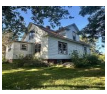
LOTS 3 & 4 CHASE AND BOCK ADD. 0.70 AC. ALLEN