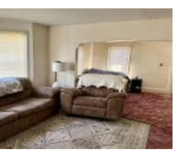
E 97.7" Lot 5 BLK 1HiLLS ADD MERRILL