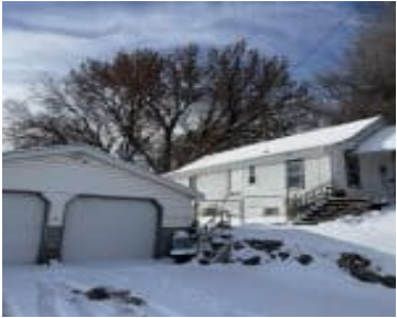
TABLE REPLAT BLK 15 LOT 6 BLK 15