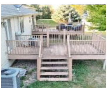
0 29 9 Unit 2 & 1/4 undivided interest in common elements of Brodee condominiums in Part Lot 2 Oak Park Addition