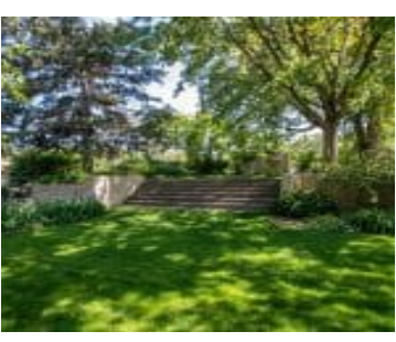
PEIRCES ADDITION N 1/2 OF LOT 20 AND ALL OF LOTS 21 & 22 BLK 148