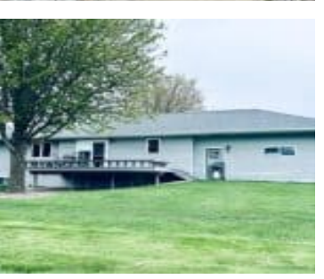
Lot 2, Block 3, Smith-Quam Addition, City of Vermillion, Clay Co., SD