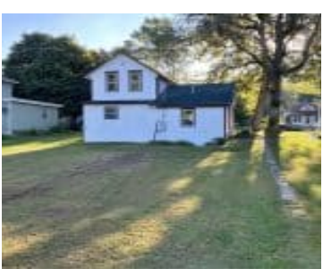
Lot 4, Block 60 to the City of Le Mars, Ply Co. IA