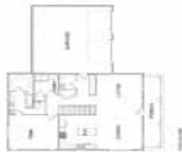
502 Zach Road Main Floor Plan