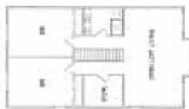
502 Zach Road Second Floor Plan