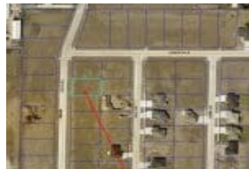
502 Zach Road Lot