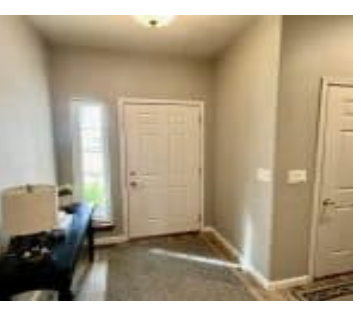
TOWN OF SGT BLUFF PRAIRIE VIEW 2ND ADDN LOT 11