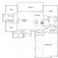
506 Zach Road Model Floor Plan