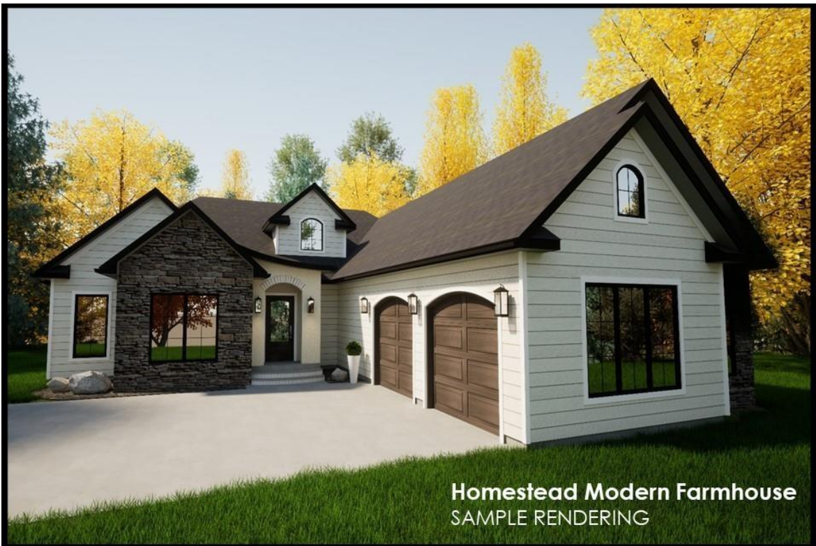
Homestead Modern Farmhouse SAMPLE RENDERING