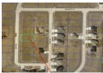
506 Zach Road Lot