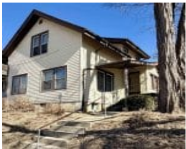
TABLE LOT 4 BLK 6