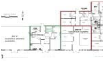
LOTS 5, 6 & 7 FAIRGROUNDS SUBDIVISION to the City of Spirit Lake, DCI