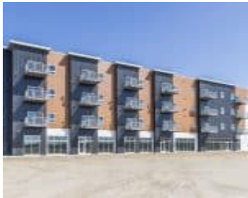
Lot 367 Flatwater Crossing Phase 1