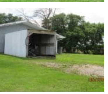
21-83-43 Pt SE SE, See Long Legal