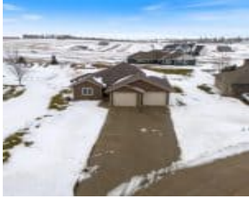
L 29 Southern Hills Estates 3rd Add