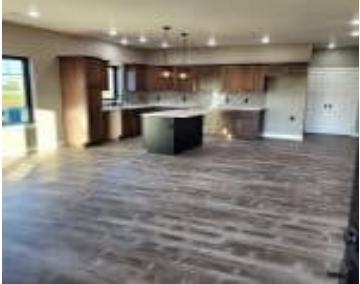
Sheldon Crossing Plat 2 Lot 23, Block 1