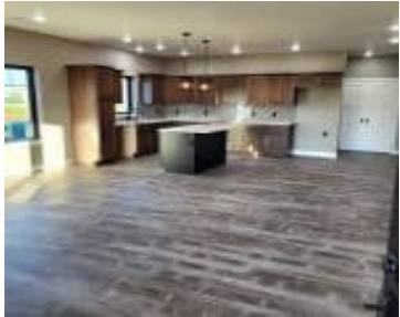
Sheldon Crossing Plat 2 Lot 23, Block 1