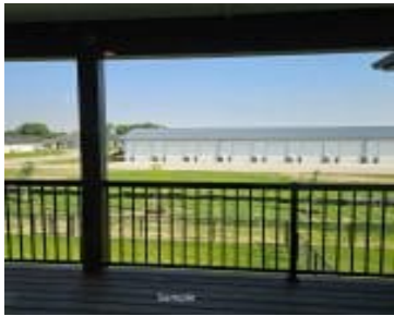
Lot E Tract 16 River Valley Addn in N1/2 SW1/4 NSC (.161)