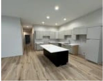
LOT 14 LAKESHORE ESTATES 4TH ADD NORTH SIOUX CITY