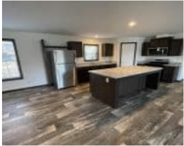
Lot 7 Block 4 Hill's 77 Addition