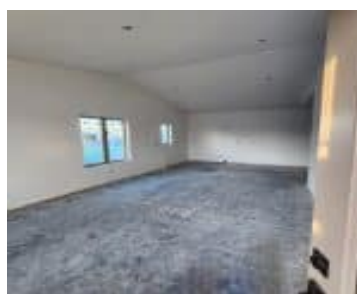
Sheldon Crossing Plat 2 Lot 22, Block 1