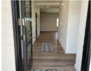
UNIT 5 SOUTH GREENVIEW EST ASSN ZERO LOT LINE