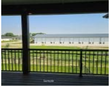
Lot B Tract 16 River Valley Addn in N1/2 SW1/4 NSC (.167)