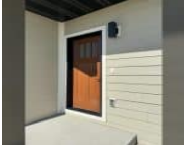
L27PUDDLE JUMPER TRAIL, TENTH ADD