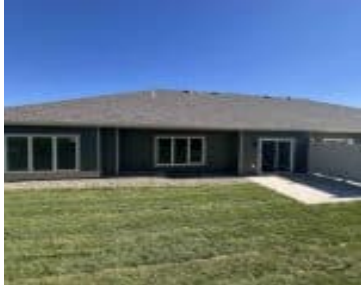
L15 MEADOW CREEK THIRD ADDITION