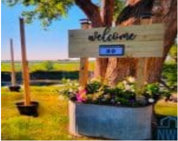
Fairview twp mounts building on leased site