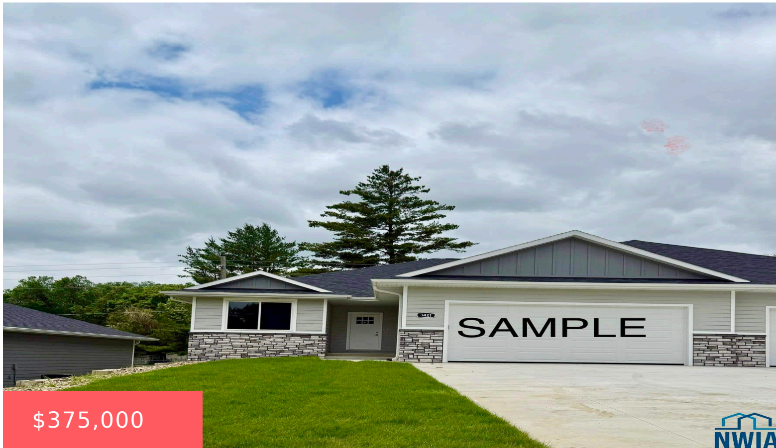
ROY DAVE ADDITION LOT 4