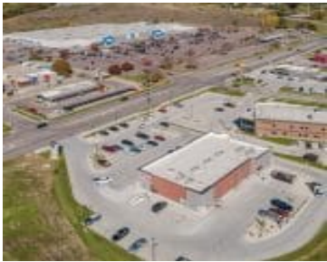
NORTHERN VALLEY CROSSING 5TH LOT 5