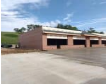
CHESTNUT HILL THIRD ADDN LOT 52