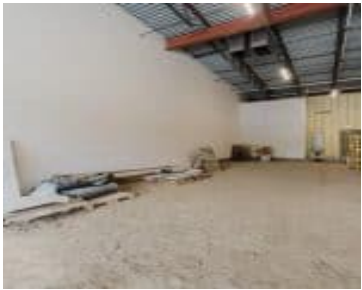
NORTHERN VALLEY CROSSING 5TH LOT 5