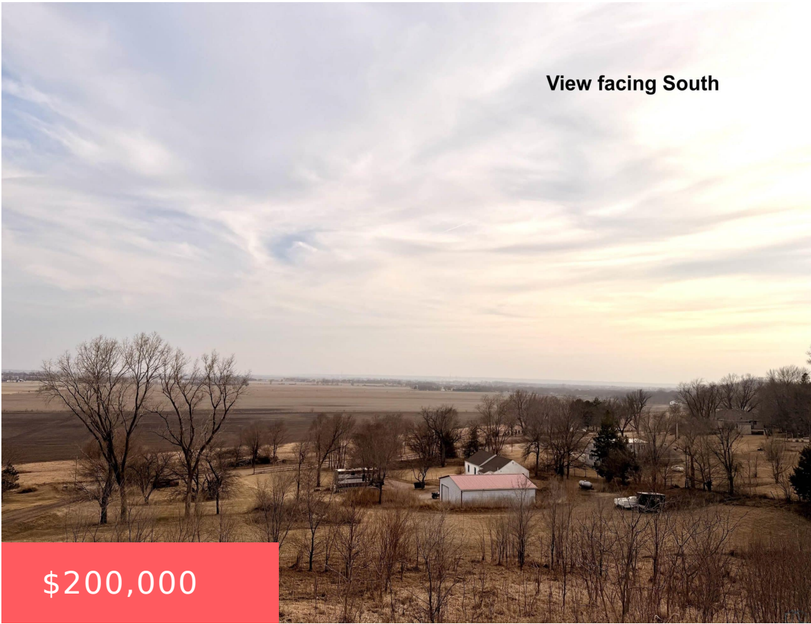
View facing South