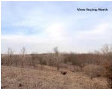
View facing North