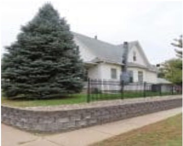
TABLE N 44 FT LOT 1 BLK 18