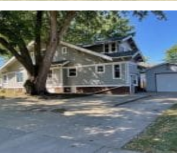
Lot 6, Block 59, Town Lot Co's 8th Add