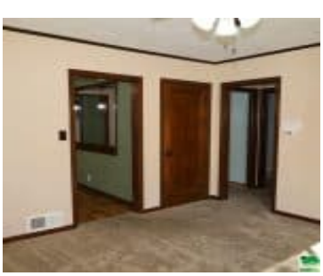
Lot 3, Block 1, Fisher & Monson Addition to Rock Rapids, Lyon County, Iowa